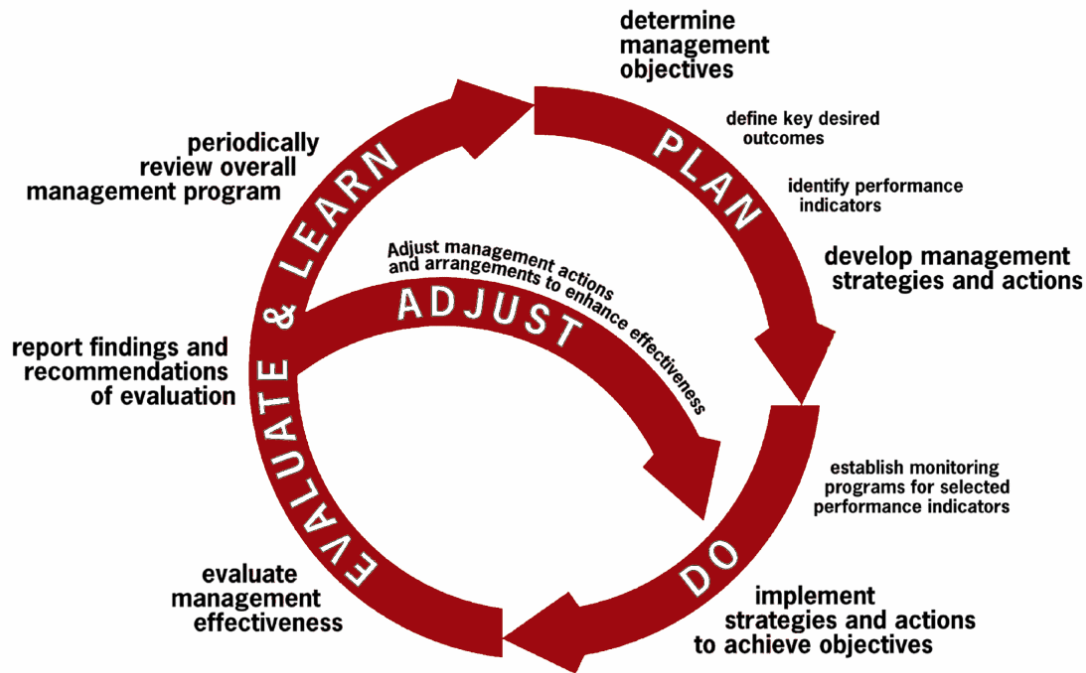
Figure 2: Adaptive management cycle

The ideal fisheries management regime is one that has effective, precautionary, adaptive management arrangements in place for the stock supported by good scientific advice and is effectively enforced. This implies that effective fisheries management arrangements should include monitoring, assessment and decision making processes that respond appropriately to feedback in the management system, including to non-compliance issues. Few fisheries management regimes will exhibit all of these characteristics. The M-Risk assessment considers the extent to which these characteristics are present in the management regimes implemented by the management bodies for the stocks under assessment.